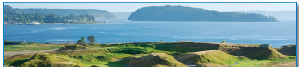
Chambers Bay Golf Course, with Puget Sound in the background

At Chambers Bay, golfers walk and are encouraged to hire a local caddie to carry their bags. No electric or fuel-driven carts are allowed. The clubhouse sits at the top of the ridge, overlooking the golf course and Puget Sound. A pier extends into the Sound, providing fishing access to the public, and the Amtrak passenger train still rolls past daily between the water and the edge of the golf course.