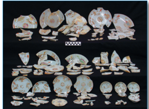
"Four Flowers" Porcelain Artifacts recovered from the Folsom Chinese Community Excavations

wok fragments and ash) used by inhabitants of a boarding house. The excavations recovered over 50 boxes of artifacts, most manufactured in China. Comparing the collections