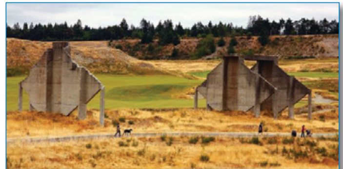
Remnants of the gravel bins, with walking trail in front and the 18th fairway in the background

It's only been a few years since the course opened but it already operates in the black, with money left over to pay off the cost of its construction. Since its opening in 2007 it has hosted the U.S. Amateur tournament and has been chosen as the site of the 2015 United States Open Championship, a tournament that is projected to attract over 60,000 spectators per day and at least $140 million dollars into the Chambers Bay/Tacoma area. The