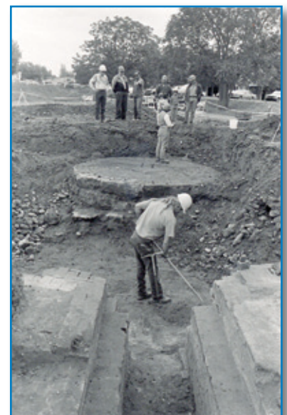
Folsom turntable, 1993 with members of the public observing the work.