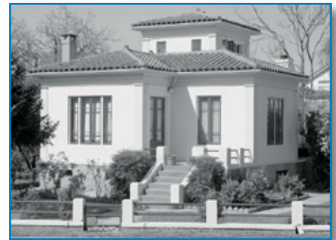
Murer House, Folsom, CA ( www.murerhouse.org )

Note: for information on the Murer House Foundation visit www.murerhouse.org . For details on the work of the FEDS and opportunities to participate in their annual handcar race visit www.fedshra.org . ❧