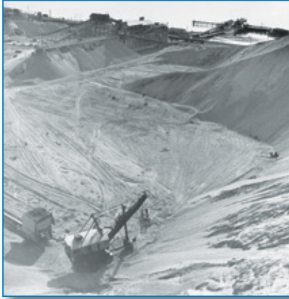
Gravel and Sand Quarry Operation, ca. 1960s

mining continued at the site until 2003, giving the county the time to develop a reclamation plan.