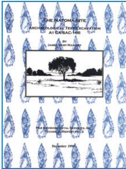
Natoma Site Publication (available through PAR).

on the old railroad grounds in downtown Folsom and uncovered ground stone, lithics and other evidence of Native American life in Folsom. We are currently working with the UAIC and the City of Folsom to design a landscaped plot for the railroad block containing native plants and commemorative signage to interpret the long Native American use of Folsom for the general public. As part of a treatment plan developed for the railroad block project we are preparing an ethnographic/ethnohistoric study for the Folsom region. This study will incorporate archival and oral interview data, discuss land use patterns and disturbances and review aerial photographs and other information to develop a Native American ethnography and assess sensitivity of the City and surrounding areas. If you would like to experience a bit of Folsom's Native American history, take a walk on the trail leading from the Folsom Powerhouse down to the river and keep an eye open for the bedrock milling station along the route. Enjoy a picnic lunch and a swim in Lake Natoma while you are there!