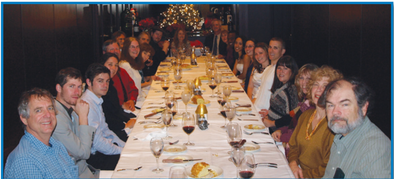
2012 Holiday Party at Morton's Steak House