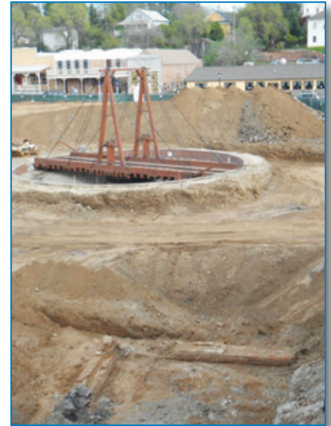
2011 excavation with Perkin's Warehouse foundation in foreground and historic turntable in background