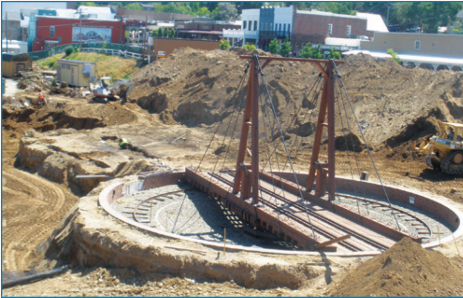
Excavating a brick well (left rear) and roundhouse (center) with historic turntable, 2011