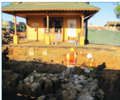
Folsom Jail House Foundation at the Chamber

Public involvement is always tricky with archaeological projects and the Folsom Railroad Block project was no different. The historic site is a vital part of Folsom's rich railroad history that provides colorful insight into its commercial main street, Sutter Street and the formation of the town itself. While the site proved to be rich with archaeological data, there were two issues that made it difficult and challenging for site visits. First, there were few distinct foundations that offered the general public a clear understanding of what they were seeing. Second, work was spread out over a large active construction site full of heavy equipment in operation.