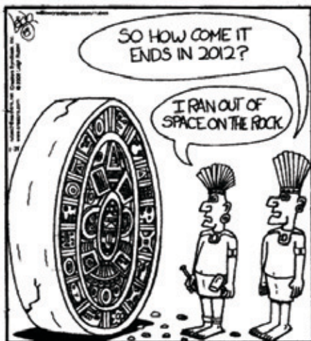
At last, the mystery of the Mayan calendar revealed.