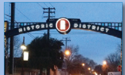
The lighting of the arch, January 2012

On January 19, 2012 PAR attended the official "lighting of the arch" ceremony at the dedication and completion of the R Street project. PAR began work on the environmental document for R Street in 2006 and stayed involved throughout the life of the project, including monitoring construction efforts and working with the Teichert construction crews to salvage and reuse railroad-related material along the corridor. The project completion represents a legacy of a true community effort, combining the vision and skills of the City of Sacramento, Capital Area Development Agency (CADA), Sacramento Area Council of Governments (SACOG), Mark Thomas and Company (project engineers) and the local business community to improve and develop R Street. The challenge for the project engineers and for PAR's environmental team was to improve, widen and revitalize the street while maintaining the historic commercial district and railroad history of the R Street Corridor. The new arch, railroad-spike shaped bicycle stands, retention of railroad tracks along the street, reuse of the old granite cobbles that once stabilize the tracks at intersections, historic period lighting, and retention of loading docks and sidings work together to modernize the corridor, yet pay tribute to its long history. If you are in Sacramento, visit the Fox and Goose and other local businesses on the corridor and check out the results of five years of hard work by many people! ✂